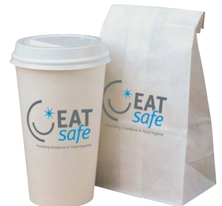
Example of possible branded merchandise for Eat Safe businesses.

elaine.doyle@foodstandards.gsi.gov.uk or by post to Food Standards Agency Northern Ireland, Unit 10 a-c Clarendon Road, Belfast, BT1 3BG , by 31st October 2005.