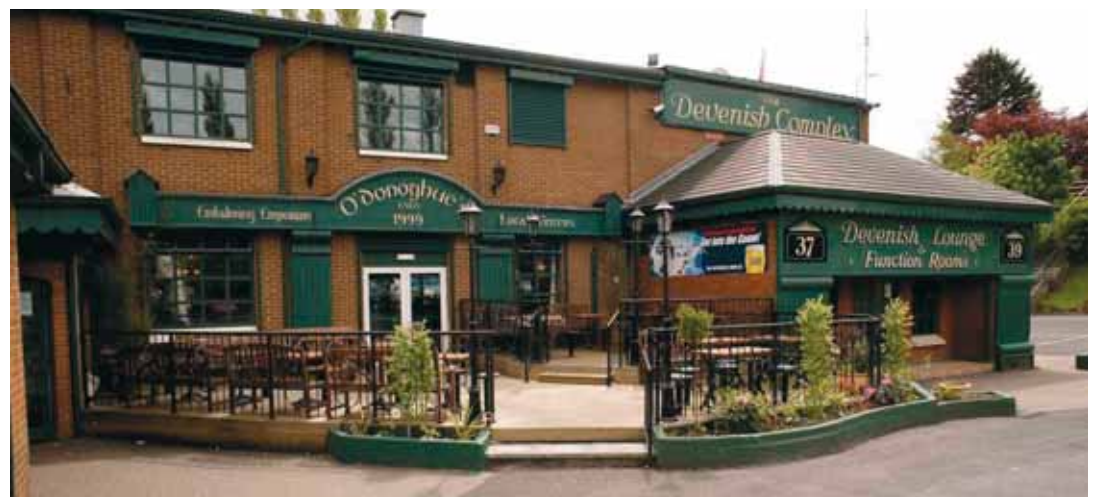
Devenish Complex, Finaghy.

consumers are very interested in knowing that their food is hygienically prepared, and as we see more Eat Safe logos across Belfast, and Northern Ireland, it will help to get that message across.